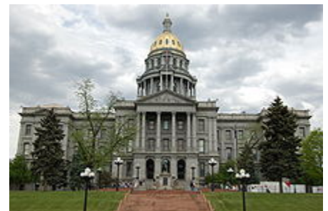
Colorado State Capitol, Denver

Download AAUW's new Program in a Box: Title IX Compliance: Know the Score at http://aauw.org/advocacy/laf/lafnetwork/library/TitleIXCompliance.cfm